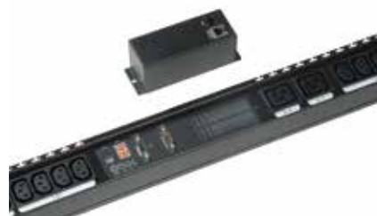
PDU 008 A

PDU VISION, WEB/SNMP manager interface for the connection to the LAN network. The device - suitable for remote monitoring – can be integrated into the PDU.